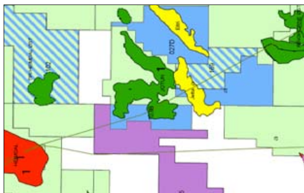
The map shows an outline of the Eitri and Jetta prospects. The Phi prospect is located below Eitri, and can be tested with the same exploration well as Eitri.

The Freke prospect in PL 029B is planned drilled in early 2009. Det norske shall operate the exploration well on behalf of ExxonMobil, the operator of the license. Expectations for Freke are higher after StatoilHydro this fall confirmed that the oil discovery on Ermintrude, made in 2007, is located in the same structure as the Dagny discovery.